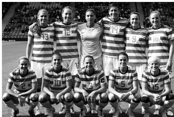
The U.S. Women's National Soccer Team

With the recent success, there have been rumors of a new women's soccer league