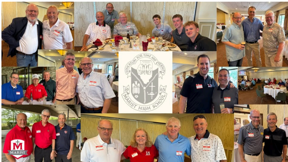
Legacy Lunch on July 8th at Gaelic Park